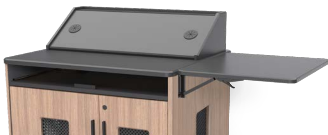
SH-FL-51 installed on PD51 Station (Sold separately)