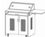
PD51 Mobile Station 36.5"W x 30"D x 47"H