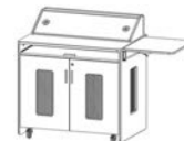
PD5107 Dual Rack Station 42.75"W x 30"D x 47"H