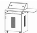
PD5103 Podium 29.75"W x 30"D x 47"H